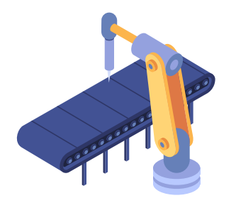
Conveyorised or static options available